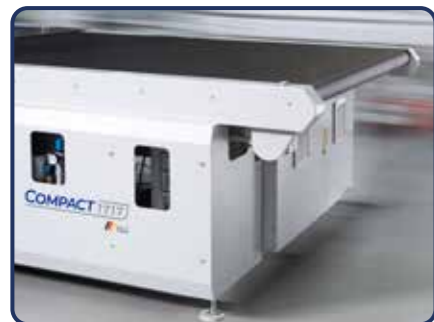
Space behind the clearing belt for collecting container.