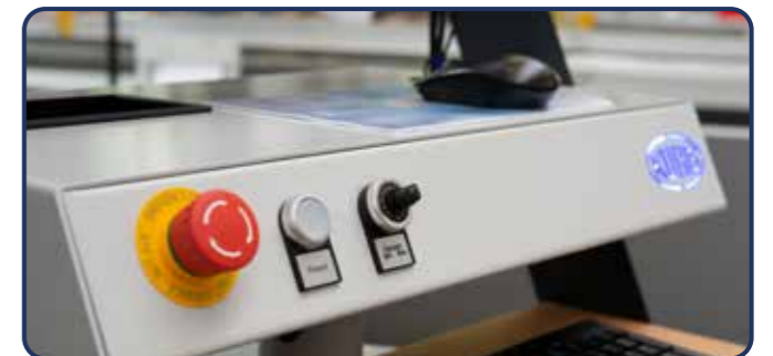
New control panel with indicator light and touch display