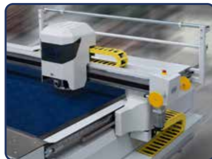
Service-friendly cable drag