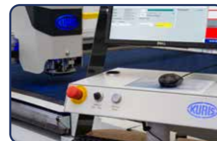
Cutting head and control panel with readiness LED display