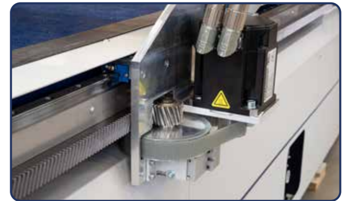
Gear drive for maintenance-free and precise running of the bridge incl. cutting head