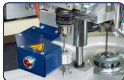
Hot drill unit

Our knives are available with different coatings. The blades are optionally equipped with either serrated or saw tooth grinding and are made from HSS or carbide.