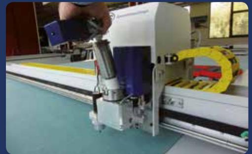
Short set-up times thanks to plug & cut connection