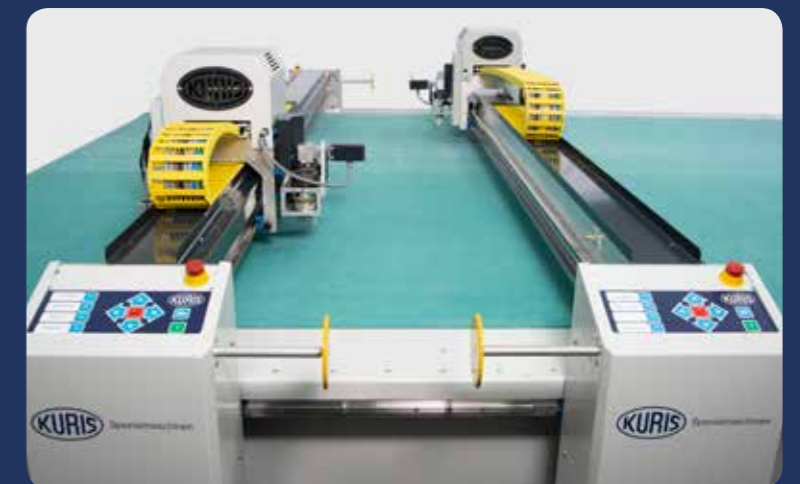
Optionally with double bridge: Two bridges for independent cutting with two cutting heads in one cut pattern.