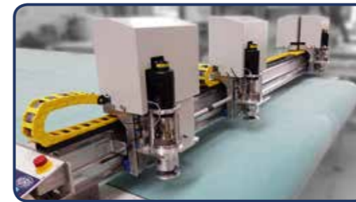
Cutting bridge with 4 cutting heads (cutter for carpet tiles)

Fast and flexible options are provided for a variety of parts.