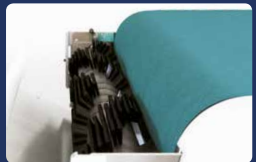
Cleaning brush: This optionally available cleaning unit eliminates any cutting residues

The comprehensive product range also allows solutions tailored to your particular needs. In our showroom, spreading and cutting machines are available for general demonstrations as well as for test cuts with your own materials.