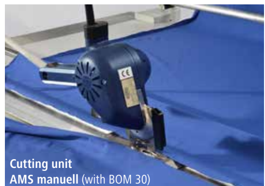
Cutting unit AMS manuell (with BOM 30)

The comprehensive product range allows solutions made for your requirements. Spreading and cutting systems are available in our showroom for general demonstration as well as for test cuts with your own materials.