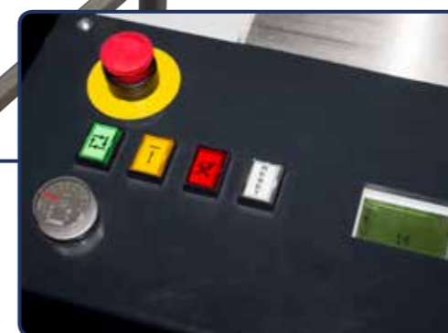
Operating device with button controls on the CROSSCUTTER C3

The manual version of the Crosscutter has a cutting unit with vertical lift and a fabric rail with quick adjustment. The "BOM 30 S" or alternatively the "BOM 101 S" is provided as the cutting unit. A mechanical length counter can also be optionally selected.